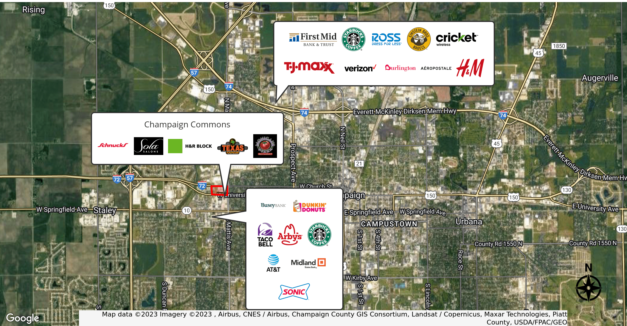
Map data ©2023 Imagery ©2023 , Airbus, CNES / Airbus, Champaign County GIS Consortium, Landsat / Copernicus, Maxar Technologies, Piatt County, USDA/FPAC/GEO

109 N. MATTIS AVENUE | CHAMPAIGN, IL 61821